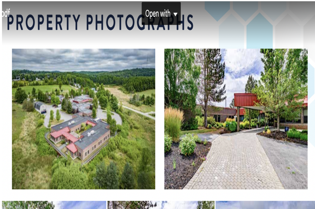
Figure 1. Maine Arts Academy Aerial Map